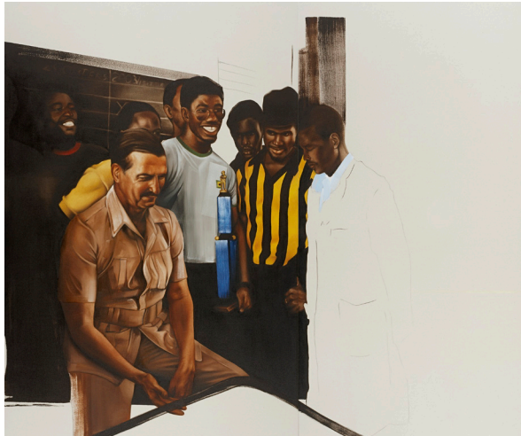
Meleko Mokgosi, Pax Kaffraria: Terra Nullius (detail) , 2009–2012.