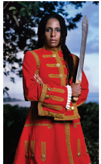
Renée Cox, Redcoat , from "Queen Nanny of the Maroons" series, 2004.

NEW YORK, NY, June 5, 2012— Caribbean: Crossroads of the World is the culmination of nearly a decade of collaborative research and scholarship organized by El Museo del Barrio in collaboration with the Queens Museum of Art and The Studio Museum in Harlem. The exhibition, comprised of more than 500 works of art spanning four centuries, emphasizes the relationship between the Caribbean and the United States and the artists from both locales who contribute to ongoing conversations about national and regional identity and belonging.